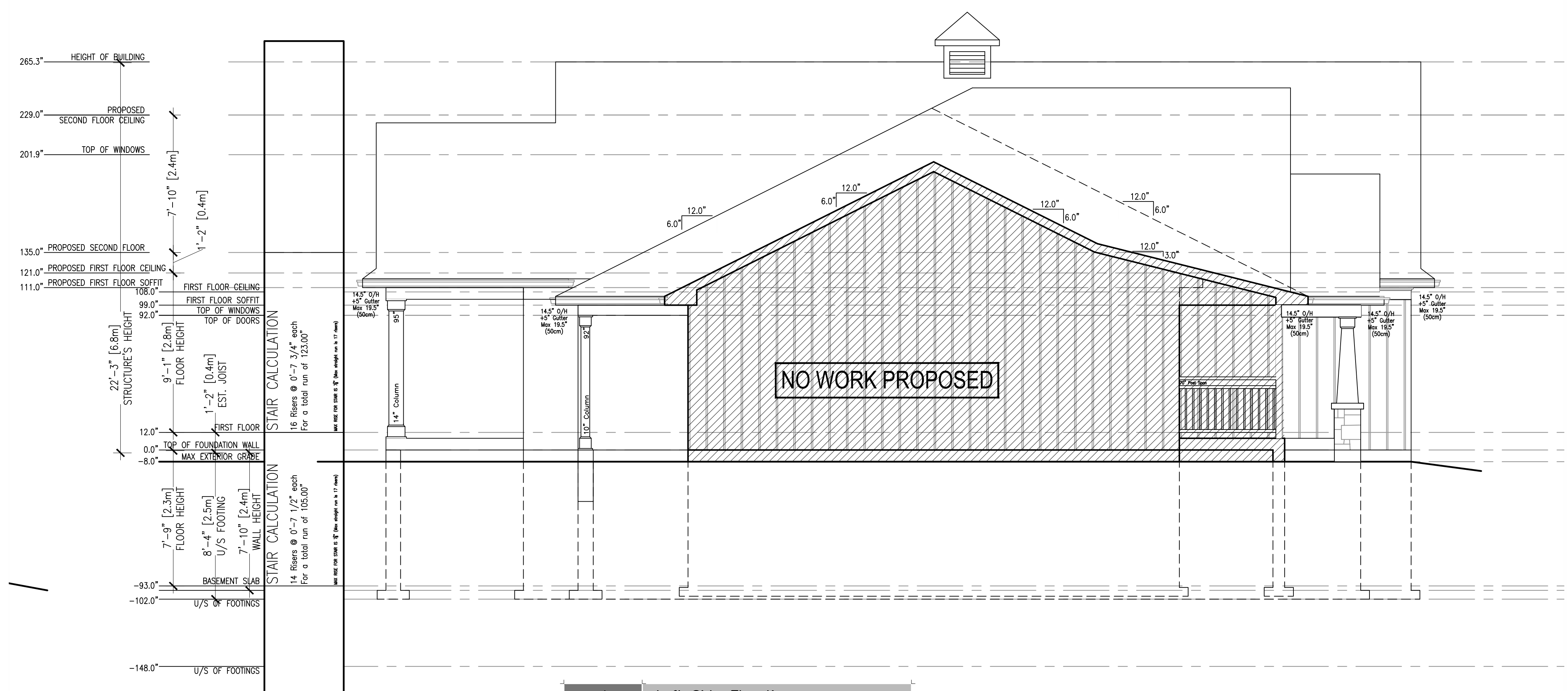
A Left Side Elevation VO1 SCALE 1/4" = 1'-0"